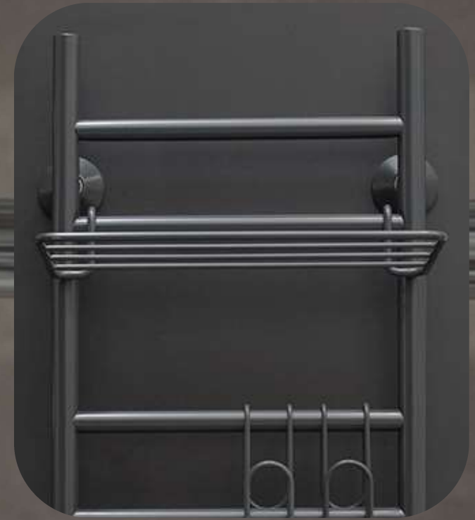
Pivo shelf and REJ hooks